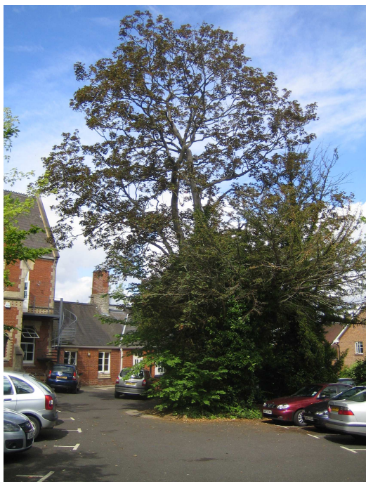
[Maple & Yew tree]